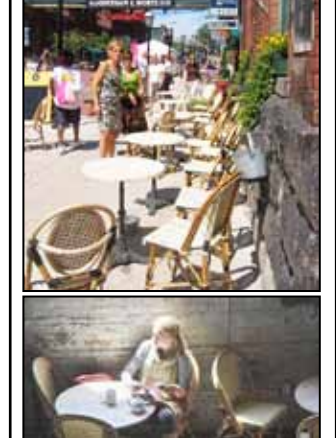
Balzac Cafe INDUSTRIAL VICTORIAN ARCHITECTURE IN TORONTO

will last two to three it would help women who weeks, which would work are thinking of getting permanent augmentation to "see what the weight will actually feel like and what makeup that would be injected into patients, but he says it's a saline solution with an additive FDA and anticipates getting that's already used in the procedure to market by medical circles for other 2016. Guys might be able to take advantage of it, too: Rowe suggests they could use the procedure to benefit their Pecs and calves.