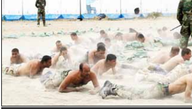
Tribal fighters take part in a military training to prepare for figh the Islamic State militants, on the outskirts of Ramadi, west of

ways: word spread that Iranianbacked Shiite militia fighters were gearing up to help the ties between Baghdad and