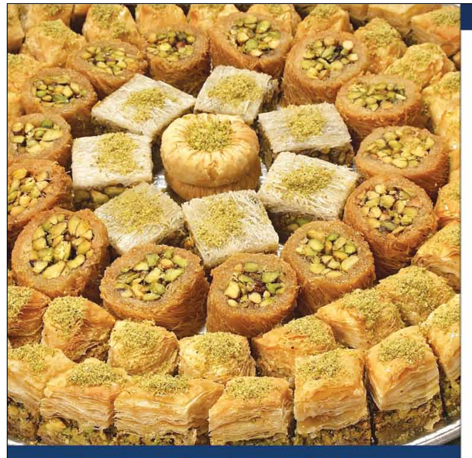
A Royal Experience to Share with Your Family & Friends!